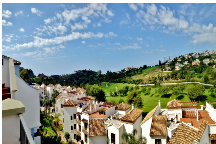
90 sq. mtrs. of rooftop solarium